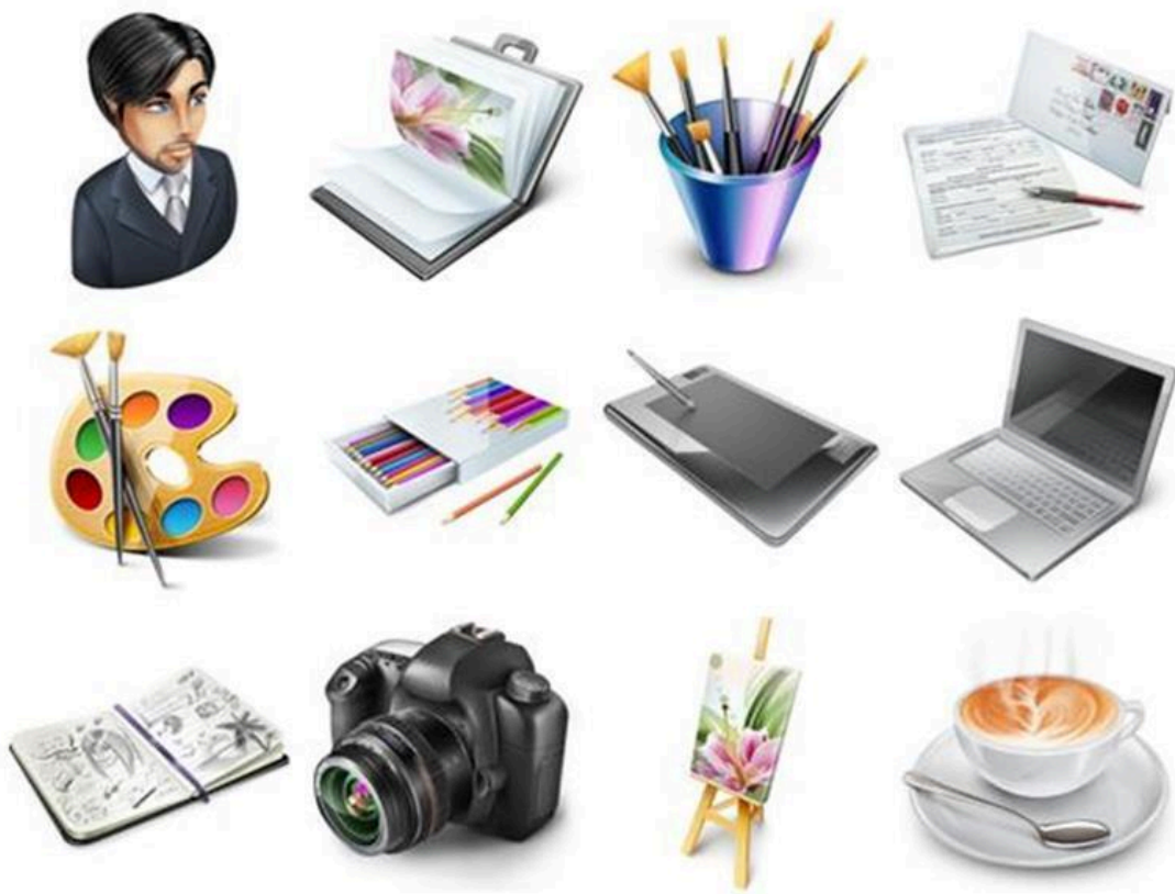
Grandpa's favorite icons!